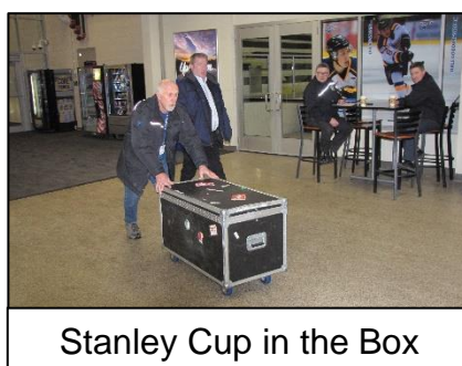
Stanley Cup in the Box